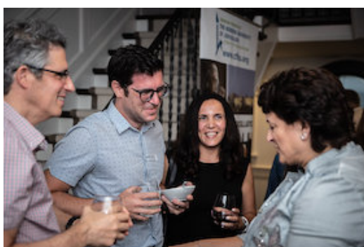
View Photos from CFHU's Israeli Culture Evenings!

FOR A LIST OF UPCOMING CFHU EVENTS, CLICK HERE!