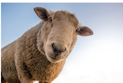
Gene Therapy for Visually-Impaired Sheep Now Safe for Human Trials